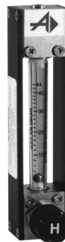
Series 50 Flowmeter