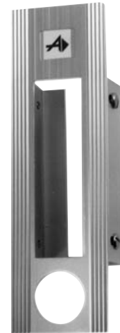
FM 4711 Optional Panel Mounting Bezel