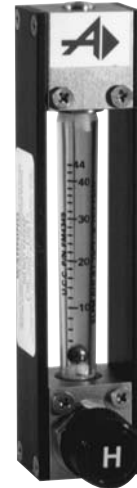
Series 50 Flowmeter

Tubes: Borosilicate Glass with float stops of Teflon® Floats: Borosilicate Glass, Type 316 Stainless Steel or Carbonyl as specified in Tube Selection Tables End Blocks: See Table I Inlet/Outlet Adaptors: See Table I Side Plates: Aluminum Back Plate: White Plastic Front Plate: Clear Plastic Seals and Packing: Viton® (other materials available on special order) Valve: Type 316 Stainless Steel