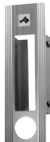
FM 4711 Optional Panel Mounting Bezel