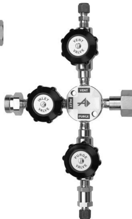
SG3897 Purge Assembly