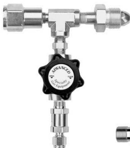
SG3893/SG3894 Purge Assembly