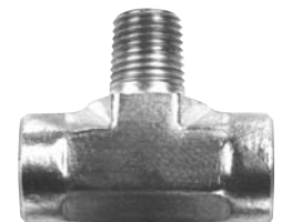
Male Branch Tee